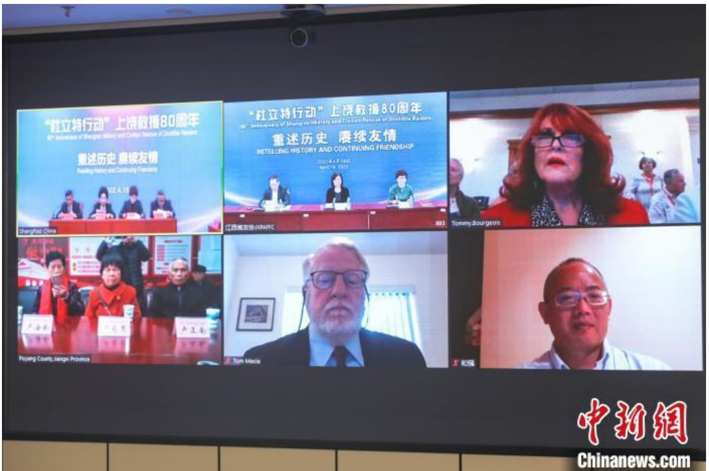
The picture shows the video conference of the 80th anniversary of the "Dulitt Operation" Rescue in Shangrao.

80 years ago, on April 18, 1942, the United States successfully carried out the first military bombing of the Japanese mainland, "Operation Doolittle", which was a major event in World War II. The operation was carried out by 16 B-25 bombers of the Army Air Corps led by Lieutenant Colonel Doolittle of the United States. After completing the bombing targets, 15 of them flew to Jiangxi, Zhejiang, Anhui and Fujian in China to crash or force land, and the Chinese military and civilians launched a large-scale rescue of the pilots of Operation Doolittle, and a total of 64 American pilots were rescued and safely evacuated.